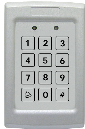
AY-Q55 Pin Reader Piezoelectric Keypad