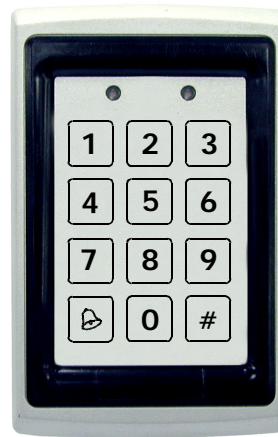
AY-Q65 Prox & Pin Reader Piezoelectric Keypad